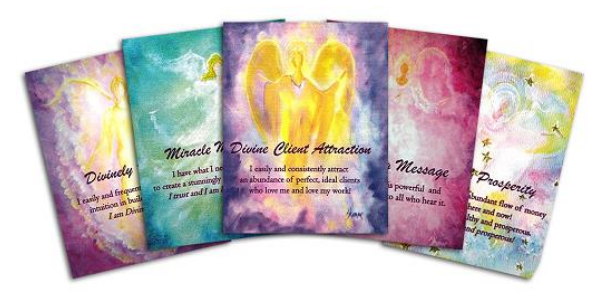
Divine Business Angel Cards Activate Your Divine Team for Guidance, Clarity & Support

Some people use them when they are challenged in a specific area in their business. They find the angel card reminds them of the truth: they CAN build their Divine business and make it an abundant, sustainable one!